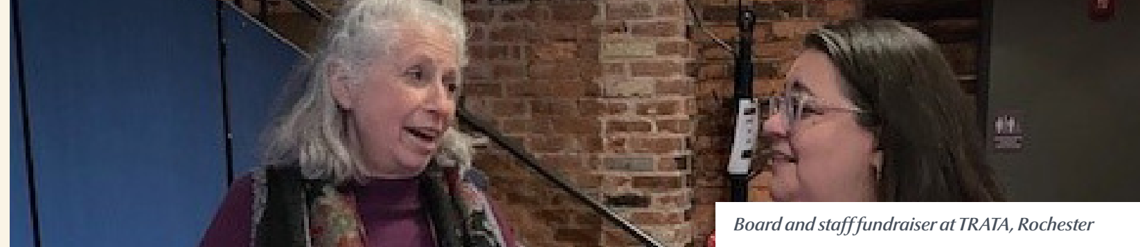
Board and staff fundraiser at TRATA, Rochester