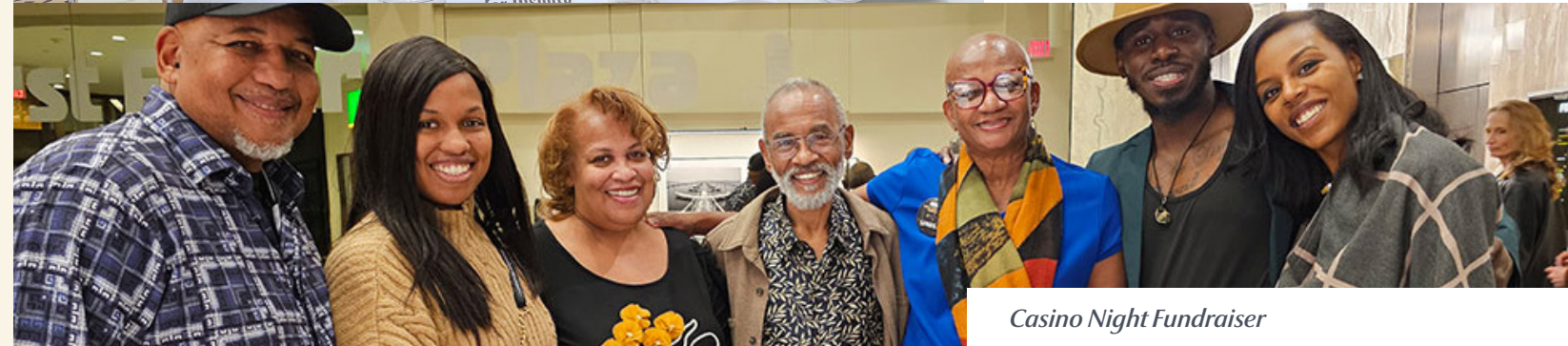
Casino Night Fundraiser