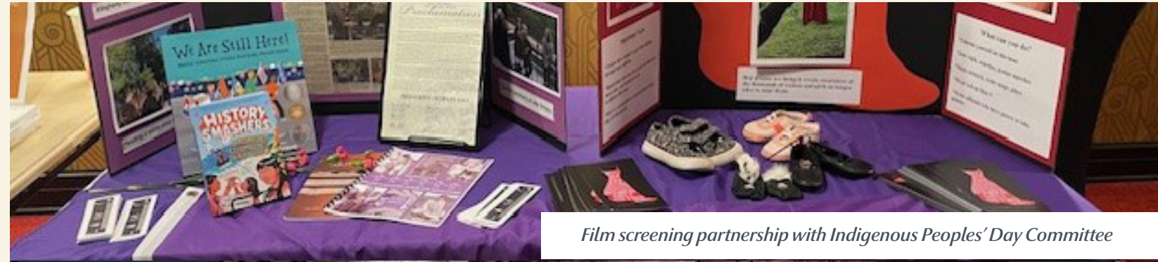
Film screening partnership with Indigenous Peoples’ Day Committee