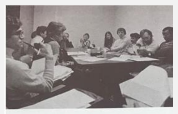
ROCHESTER NCDS ADVISORY BOARD